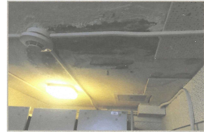
Roof leaks in the Carmel High School music building

Many of our schools and classrooms have outdated electrical wiring, old plumbing and piping, and other underground utilities that are original to the schools and require replacement to minimize costly repairs. Some classrooms don't have sufficient heat on some days or air-conditioning on others.